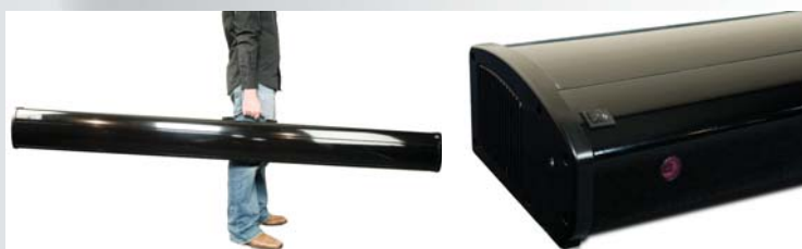
Durable aluminum black case with piano gloss finish