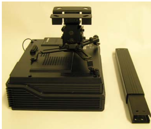
Example of A56-E25B with out extension bar for a flush mount to the ceiling.