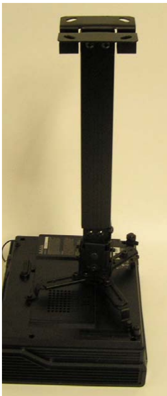
Example of A56-E25B with extension bar for high or angled ceilings.

The A56-E25B Projector mount is 90% compatible with most projector designs. It is easy to use for ceiling projector installations. It includes standard screw hardware for the projector. It can be adjusted in both length and height to optimize the right level of projection. The extension bar can also be removed for low ceiling installation, please see example #1.